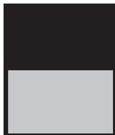
1/2 Page • Horizontal