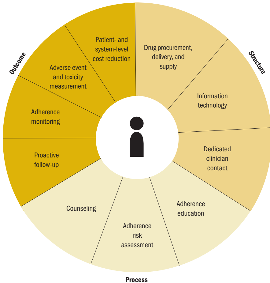
FIGURE 2. Scoping Review Model

This scoping review identified 20 distinct OAM programs reported in the literature, which included an aggregate of 10 components aimed at improving patient adherence. The programs included