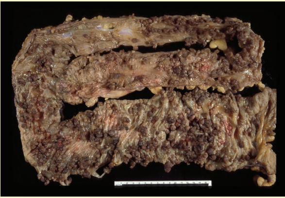
FIGURE 2. SURGICALLY RESECTED BOWEL WITH POLYPS

Note. This surgically resected bowel shows a "carpet of polyps," which is typically seen in familial adenomatous polyposis.