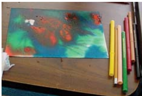
Figure 1. Monoprint Example

were held two to three times a month) with artist-interventionists recording numbers of people attending classes and details about attendees. Twenty family caregivers refused to participate in the research (average of one per session). Caregivers who refused and voluntarily stated reasons for not participating indicated that their refusals were related to salivary cortisol collection. Family caregivers who joined the class after it was in session on an impromptu basis did not participate in the AMC research protocol because consents had not been signed and the opportunity to complete pretests had passed. An average number of five participants attended each session, with an average of three family caregivers and an occasional patient, staff member from a nearby hospital, or visitor from the community. Graduate students who were interested in the research process occasionally attended the AMC as participant-observers. Outside family caregivers (those not staying in the facility) reported that they learned about the classes from flyers posted in the hospitals or by word of mouth. The 69 enrolled subjects were primarily female (80%); 38% were Hispanic, 23% were Islanders (Caribbean), and 20% were Caucasian. Caregivers were aged 18–81 years, with a mean of 48 years (SD = 14.47). Two-thirds of the caregivers were daughters, wives, or mothers of patients (see Table 2).