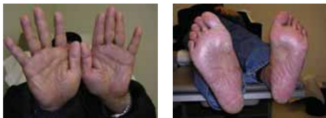
Figure 5. Hand-Foot Syndrome

Nurses who care for patients with cancer are skilled in the administration of chemotherapy agents for colon cancer. The common side effects associated with bolus 5-FU and leucovorin are mucositis, diarrhea, and myelosuppression; when the drugs are given as a continuous infusion, the side-effect profile differs, favoring an increase in hand-foot syndrome (Coyle & Wenhold, 2001) (see Figure 5). Protracted infusion of 5-FU and capecitabine (as a prodrug for 5-FU) are associated with a higher incidence of hand-foot syndrome, which manifests in tingling, erythema, and tenderness of the palms of the hands or soles of the feet (Timmerman, 2001; Wilkes, 2005). If therapy is not interrupted, the symptom complex can progress to swelling, pain, blisters, and ultimately desquamation (Wilkes). Nurses should be competent in the assessment and management of hand-foot syndrome (also known as palmar-plantar erythrodysesthesia). Patients' timely reporting of symptoms to healthcare providers can help to identify the complication earlier, leading to prompt intervention (see Figure 6). Capecitabine is an orally administered therapy; therefore, nurses must have a means for communication to patients in the homecare setting, where symptoms may occur unnoticed by healthcare personnel.