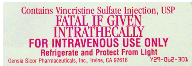
Figure 3. Example of Syringe Label That Is Affixed to Prepared Doses of Vincristine

In developing an institutional policy for intrathecal chemotherapy administration, several concepts warrant inclusion. First, chemotherapy of any kind should be given only