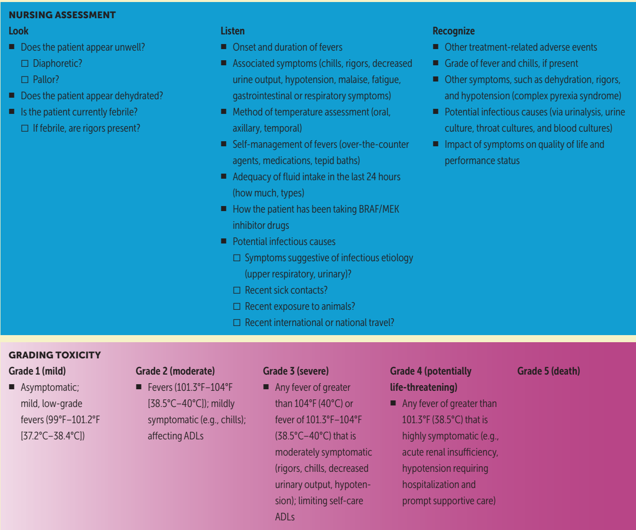
FIGURE 2. CARE STEP PATHWAY FOR MANAGEMENT OF PYREXIA: ELEVATED BODY TEMPERATURE IN THE ABSENCE OF CLINICAL OR MICROBIOLOGIC EVIDENCE OF INFECTION